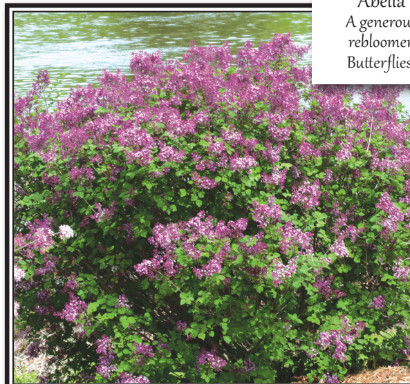
Bloomerang® Dark Purple Lilac A compact, dense lilac that blooms regularly from spring to frost.

For all the latest in Trinity gardening news, visit us at: