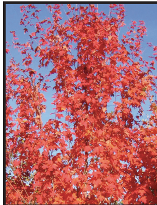
Autumn Fest® Sugar Maple Strong upright growth and fabulous early fall color.

Brilliant fall foliage, colorful blossoms, or great summer color & shade -- here are a few stunning varieties!