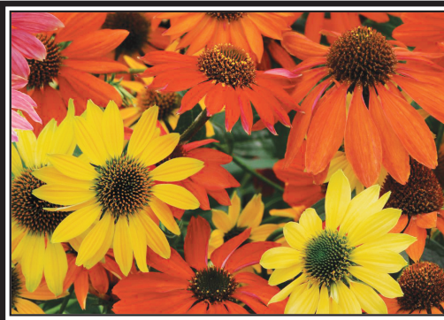
Cheyenne Spirit Coneflower A gorgeous mix of colors on stocky, well-branched plants.