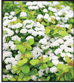
Glow Girl™ Great low, mounding contrast shrub.