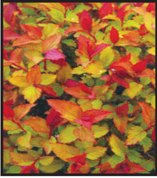
Magic Carpet Vibrant red new growth matures yellow. Pink flowers.

Showy summer blossoms attract butterflies, hummingbirds and bees to the garden.