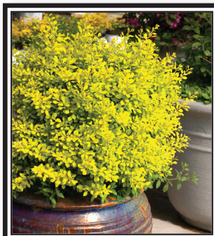
Sunjoy™ Citrus Barberry Compact, dense & burn-resistant foliage maintains its bright color from spring to frost. Very deer resistant.