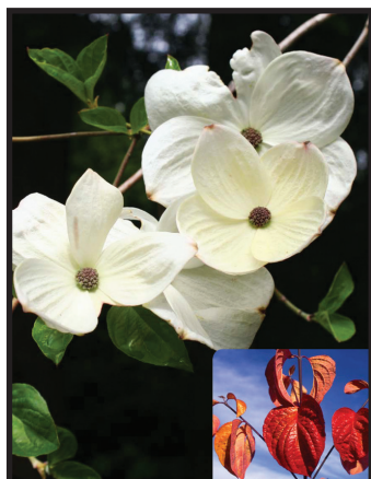
Eddie's White Wonder Larger flower bracts & a taller tree than Eastern Dogwoods.

Lovely spring blossoms, great fall color. The perfect trees for a shadier part of your yard. Here are three of the many varieties we have in stock. All are very disease-resistant.