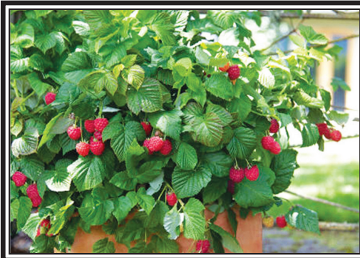
Raspberry Shortcake™ Great fruit on this dwarf, thornless raspberry. Thrives in pots!