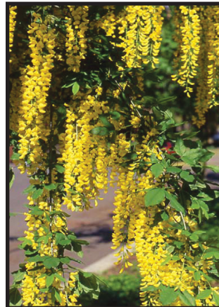
Vossii Goldenchain Upright, vase-shaped tree is stunning in bloom.