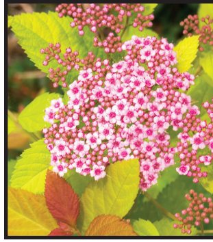
Double Play™ Big Bang Pumpkin-orange new foliage and large blossoms.