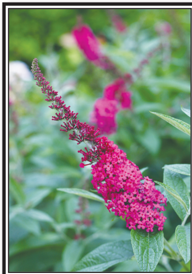
Miss Molly Butterfly Bush Compact, fragrant & the reddest of the Buddleias.