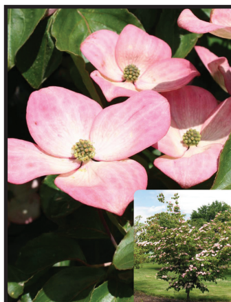
Heart Throb® Long-lasting flower bracts up to 4 inches in diameter.