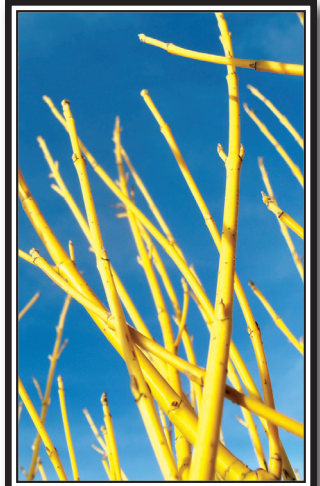
Bud's Yellow Twig Dogwood Vibrant yellow twigs brighten up the winter garden.