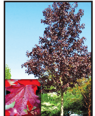
Crimson Sunset® Maple Flourishes in summer heat where most purple-leaved plants burn.