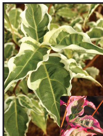
Summer Fun White flower bracts and creamy white variegated leaves.